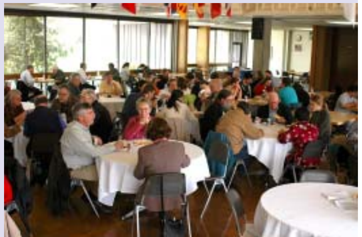
Lunch at West Valley College