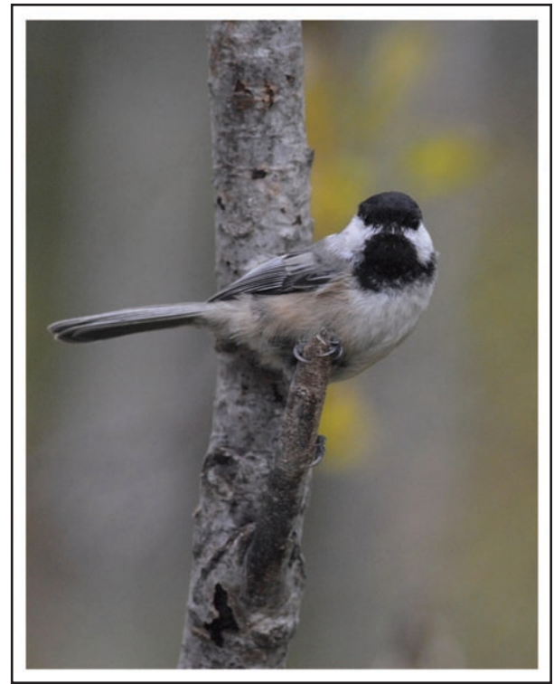
Figure 2. The black-capped chickadee ( Poecile atricapillus ) is a non-migratory food-caching bird commonly used in studies on the relationship between the environment, the brain and memory.

Finally, many of these previous studies used a categorized scale of caching intensity as their independent variable. The relevance of caching intensity is not clear for the adaptive specialization hypothesis. While caching intensity may potentially correlate with