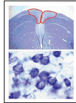
Figure 1. Representative brain section (Hp outlined) and Hp neurons of a black-capped chickadee.

Memory and its mechanisms have been particularly well studied in food-storing animals. Many species store (or cache) excess food during the fall to use during the winter when naturally available food is in short supply. Some species of birds, for example, can make well over 10,000 caches in a single fall season and rely completely on this cached food for the duration of the winter. Since many food-storing species are also non-migratory, food caching is likely an adaptation to survive harsh winter conditions. 1-4 Cache retrieval is facilitated at least in part by memory, of which spatial memory appears to be