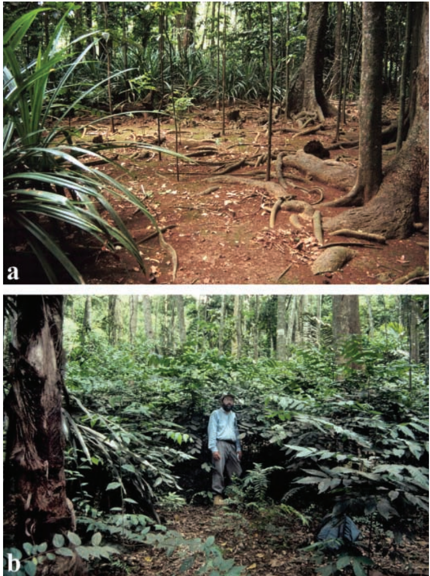
Figure 1 Impacts of invasion of island rain forest by the yellow crazy ant, Anoplolepis gracilipes . (a) Uninvaded site (Winifred Track) with open understory maintained largely by the foraging activities of the red land crab, Gecarcoidea natalis . (b) Invaded site (Dales) 1–2 years after ant invasion with a dense and diverse seedling cover and thick litter layer.

and mollusc species (O'Dowd & Lake 1990; Lake & O'Dowd 1991), and we predict accelerated rates of secondary invasion following their deletion from ant-invaded rain forest.